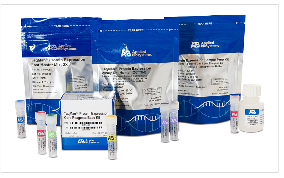
Figure 1. The new TaqMan® Protein Expression Assays family helps provide fast and easy identification and relative quantification of protein markers from limited quantities of cultured human embryonic stem cells.

Flexibility —expands beyond RNA to protein using the same instrument platform