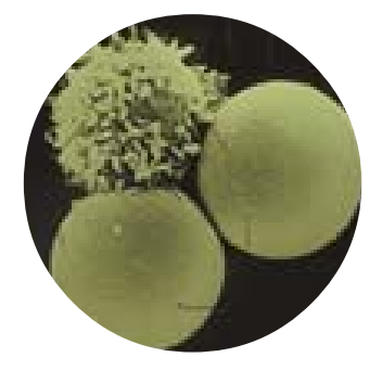
Fig. 1. Human CD4+ cell bound to two Dynabeads® CD4. (Dr H Ping Ting-Beall).

Human Embryonic Kidney (HEK) 293 cells were transiently transfected with different ratios of GluR1 and GluR2(R) cDNAs. The subunit specific cDNAs on separate CDM-8 plasmids were co-transfected with the cDNA for the lymphocyte surface antigen CD8 in a 4:1 ratio. Transiently transfected cells cells were isolated using immunomagnetic Dynabeads<sup>®</sup> pre-coated with a monoclonal human anti-CD8 antibody and used in electrophysiological, biochemical and imaging studies (2).