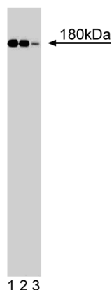
Western blot analysis of IRS-1 on RSV-3T3 cell lysate. Lane 1: 1:1000, lane 2: 1:2000, lane 3: 1:4000 dilution of anti-IRS-1.

This antibody is routinely tested by western blot analysis. Other applications were tested at BD Bioscience Pharmingen during antibody development only or reported in the literature.