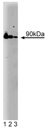
Western blot analysis of Hsp90 on a HeLa cell lysate (Human cervical epitheloid carcinoma; ATCC CCL-2.2). Lane 1: 1:1000, lane 2: 1:2000, lane 3: 1:4000 dilution of the mouse anti-Hsp90 antibody.

The 90 kDa heat shock protein (Hsp90), a highly conserved stress-induced protein, is abundantly expressed in most tissues under nonstress conditions and is required for eukaryotic cell viability. Hsp90 interacts with a number of signaling molecules, other heat shock proteins, and cytoskeletal proteins. However, the function of Hsp90 in these complexes remains unclear. It is thought that Hsp90 plays a common role in a number of diverse signaling systems due to its physical association with v-Src family tyrosine kinases, steroid hormone receptors, the Raf serine/threonine kinase, the basic-helix-loop-helix dioxin receptor, and the \beta\gamma subunits of G proteins.