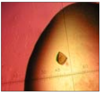
Crystal of NotI in complex with DNA substrate (Barry Stoddard and

Plating: Selection plates can be used warm or cold, wet or dry without significantly affecting the transformation efficiency. However, warm, dry plates are easier to spread and allow for the most rapid colony formation.